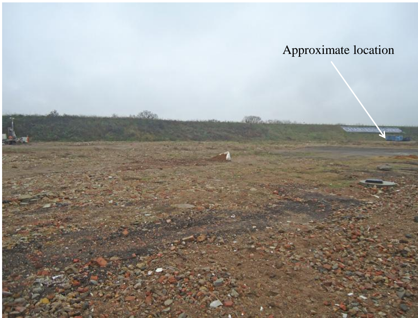
Figure 1 : View of the proposed concrete crusher location facing the southern screening bund